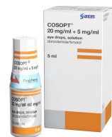
20mg dorzolamide/ml+timolol 5mg/ml timolol maleate eye drops