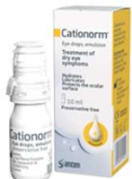
eye drops, emulsion