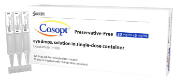
20mg dorzolamide/ml+timolol 5mg/ml timolol maleate eye drops