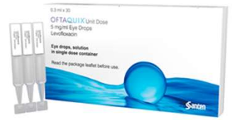
5mg/ml levofloxacin eye drops