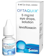
5mg/ml levofloxacin eye drops