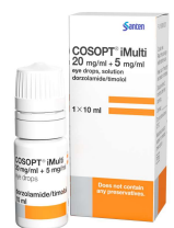
20mg dorzolamide/ml+timolol 5mg/ml timolol maleate eye drops