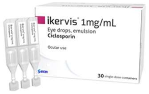
1mg/ml ciclosporin eye drops, emulsion